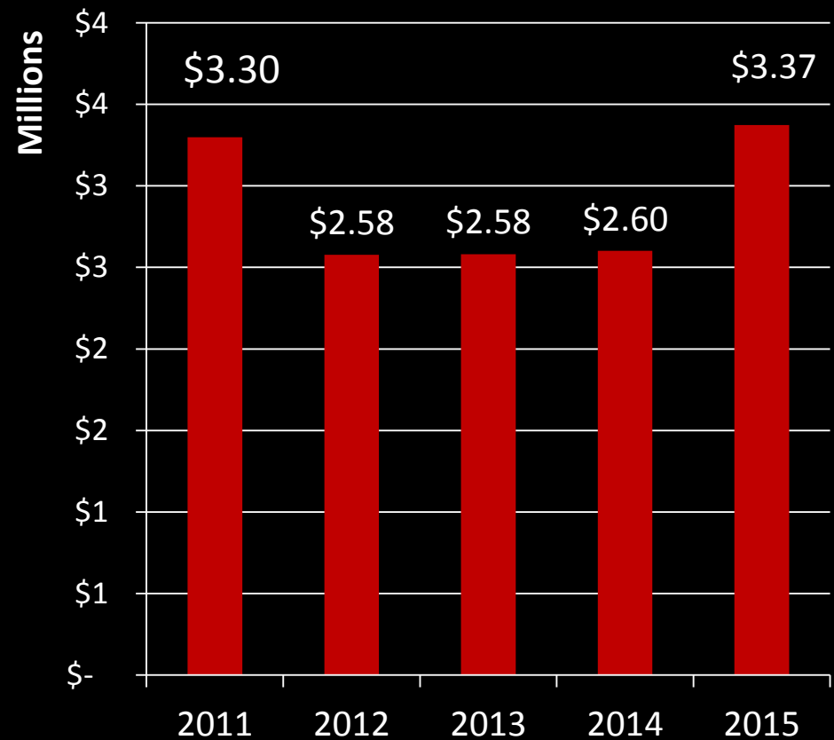
2015 Full Funding

Assumption for Now: Minimum of $400,000 Maximum $771,000